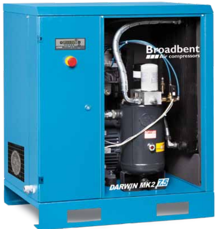
7.5 - 11 kW